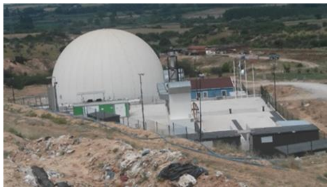
Kirkclareli Local Government Union of Construction and Operation of Solid Waste Facilities (KIRK KAB), Turkey

In order to achieve these goals, it is necessary to change the organization of waste collection, launch an effective educational campaign, as well as secure investments.