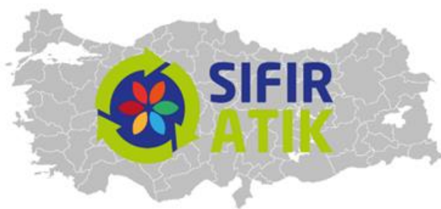
Zero waste project, Ministry of Environment and Urbanization, Turkey