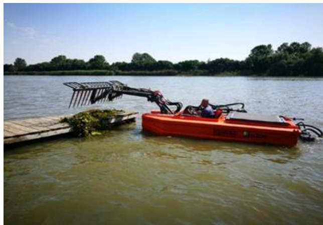
Study and field visit on FLAG AREA during Public consultations in Galati

Public Consultation was held in Galati for 3 days between 20th and 22nd of June 2019. Participants welcomed MARLENA PP's efforts to provide a viable working tool for waste management and praised MARLENA's initiative to support awareness of plastic as it chokes natural environments, endangering biodiversity.