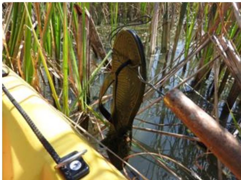
Eco-action held around protected area “Mouth of the Izvorska River”, Burgas region